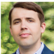
Chris Pappas New Hampshire 01