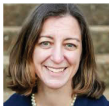
Elaine Luria Virginia 02