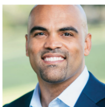
Colin Allred Texas 32