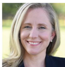
Abigail Spanberger Virginia 07