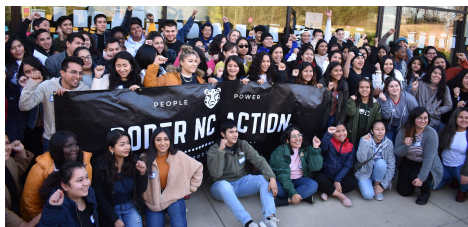
Poder North Carolina Volunteers

Our grassroots Voter Empowerment groups educate and mobilize voters so they can navigate increasingly restrictive laws and a constantly shifting landscape. The groups incur significant expenses working with local media outlets, creating and distributing print and digital materials, covering workers' food and travel expenses. Although many of their staff are volunteers, others are paid decent salaries with benefits, making significant impacts on the economy of their regions.