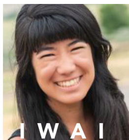
I W A I